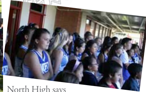
North High says 'Thank you' at morning assembly.

Congratulations Edison students on a job well done!